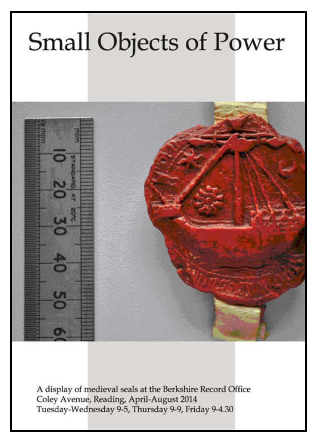
Poster advertising our seals exhibition