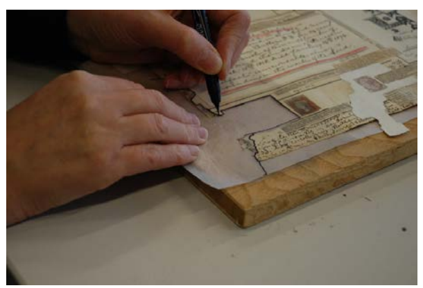
Recreating the gaps in the Farnborough scrapbook

The whole volume was disbound and then each page treated separately. Missing areas were recreated with plain watercolour paper, attached with wheat starch, while fragile items on each page were reinforced with archival heat-set tissue. Each page was then guarded with watercolour paper and resewn onto tapes, before the boards were reattached. A new, cloth spine was glued under the original leather, and a new cloth cover attached to the boards, leaving the original cloth label visible on the front.