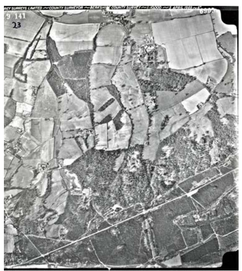
Part of Bucklebury, seen from the air in 1969

In terms of bulk, the largest two were both local authority collections. Firstly, as a team, the staff listed all the aerial photographs we inherited from the old County Council. These were taken every few years between 1964 and 1996, and (with some losses) provide an almost complete bird's eye view of the county during a period of much change. In contrasting method, one member of staff worked alone to list the 2,000 building control plans deposited with Easthampstead Rural District Council from 1908 onwards - a rich architectural resource for what would become Bracknell New Town and its surrounding villages.