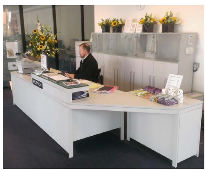
Wildean flowers ready to welcome guests

The principal events funded by the project were an exhibition and public launch event. The exhibition included items from the prison archive here, as well as rare books from the University of Reading's Special Collections. These told the story both of Berkshire's Victorian gaol, and the life of its most famous inmate. The real-life inspirations were on display for Wilde's letters about children in prisons, and for the Ballad of Reading Gaol . The exhibition was illustrated with boards providing more detail on the Victorian prison regime and Wilde's aesthetic approach to publishing. Our lottery grant also enabled us to commission a photographic survey of the prison at the point of its closure in 2013, and images from this survey formed part of our display.