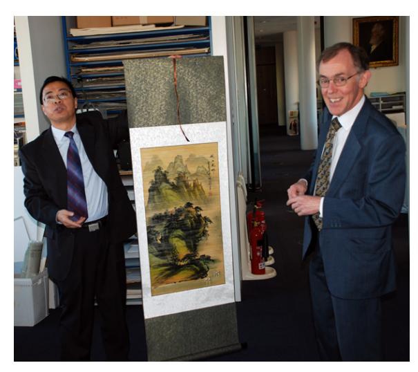
A gift from Chongqing

We were also delighted to host a group of staff from Chongqing Municipal Archives in China. The visit culminated in the exchange of gifts –a bamboo artwork in a presentation box for us, and a copy of the Historical Atlas for Berkshire for them; both sides seemed equally delighted with their bounty.