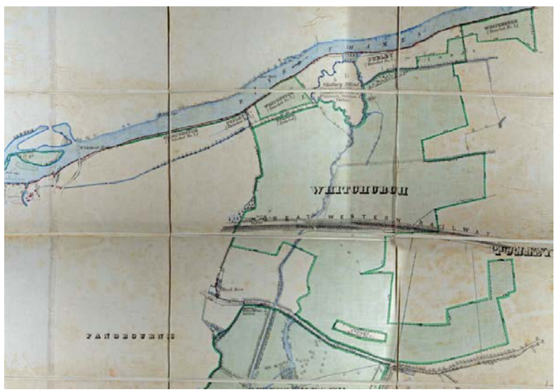
Part of the Whitchurch boundary map bought at auction

We also dipped into our documents purchase fund to purchase a small number of items that came up at auction. We are hugely grateful to our customers, who continue to drop notes and coins into the donations box. This year, their generosity allowed us to purchase two private patient case books from Fair Mile Hospital (books that should never have left public ownership in the first place); an order made at the Berkshire Quarter Sessions regarding the county boundary at Whitchurch in 1875; and a copy of the Garford enclosure award from 1827.