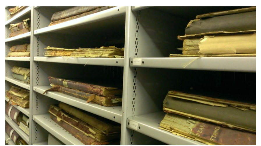
Just a few of our new - and rather battered - newspapers

Three other new collections have such substantial preservation needs that they are unlikely to become available quickly. A treasure trove of sale catalogues and other property records was retrieved from Dreweatt Neate, the Newbury land agents, while both the Reading Post and Chronicle transferred their vast archive sets of Berkshire newspapers. The latter include complete runs of the Reading Standard from 1873, and the Reading Mercury from 1773; even though the British Library has made their copies available online, we felt that we ought to take what are the 'official' copies of such key local assets. They include a very rare set of the short-lived Maidenhead Argus.