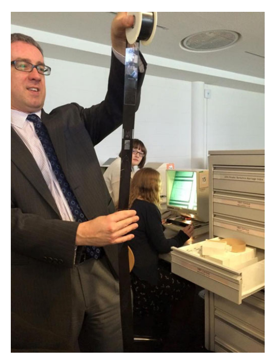
The County Archivist introduces Discovering Archives students to an ancient technology

We also worked with the University's History Department to create a new study module for undergraduates – 'Discovering Archives and Collections', and took our first students in the January term. The aim of the module is to give students an opportunity to understand how and why historical sources come to be kept, and the philosophy behind their management. Feedback has been very positive, and it is planned to run the module again in the autumn term.