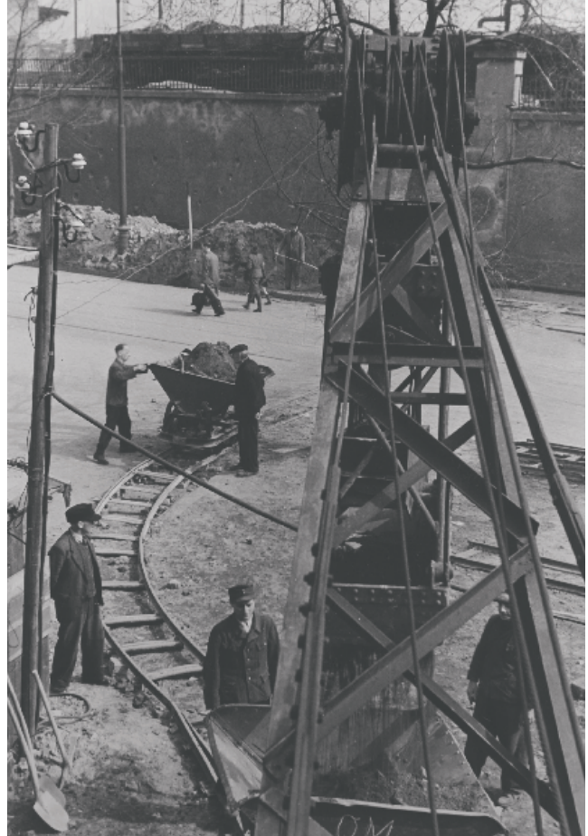
Top: Reconstruction in Dusseldorf as observed by Phoebe Cusden (D/EX1485/15/13)