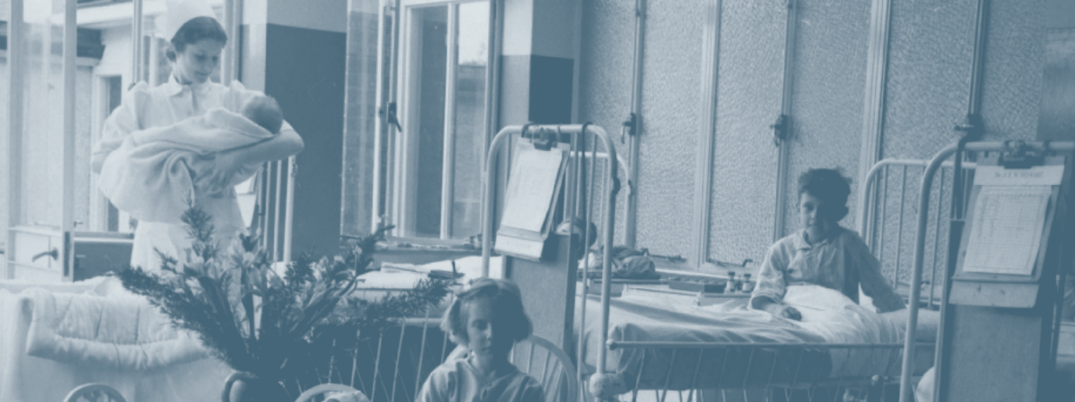
Top: The children's ward at Maidenhead Hospital in 1948 (D/H/1/26/16)