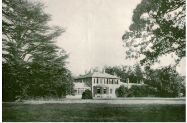
Shinfield Lodge, 1904 (D/EX1786/6/6)

The records of the Windsor Borough coroner, including the surviving case papers, 1910-1918, have now been listed (WI/JQ). Some additional material has been added to the records of Newbury District Hospital, 1930-1977 (D/H4).