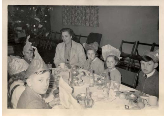
St Marks Hospital, Maidenhead staff social club meal, 1954

Why not ask about our Wroughton Room for hire. Reasonable rates, great accommodation. Call on 0118 901 5137 for more information.